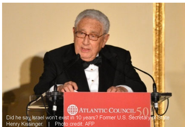
Did he say Israel won't exist in 10 years? Former U.S. Secretary of State Henry Kissinger.

A New York Post gossip columnist reported earlier this month that she had been told that former U.S. Secretary of State Henry Kissinger said that Israel will not exist in 10 years.